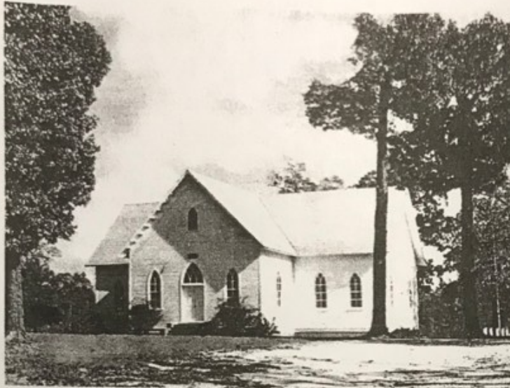
ANTIOCH BAPTIST CHURCH