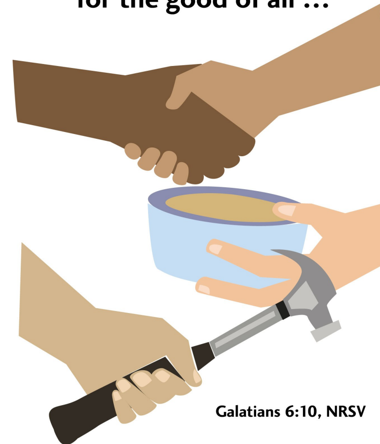
Galatians 6:10, NRSV